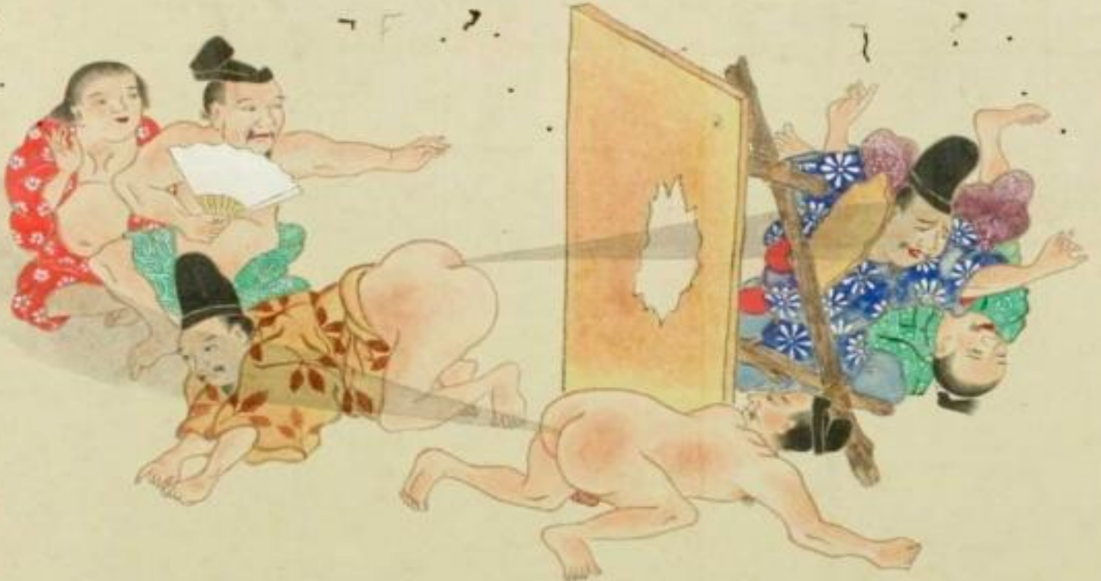
Roland the Farther was not alone; several cultures appreciated the humor of flatulence. Japanese drawing He-gassen (Fart Battle), 1864 ( Public Domain )